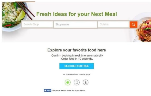
Web-Based Restaurant Application