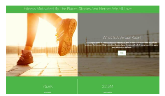
Charity Race Social Media