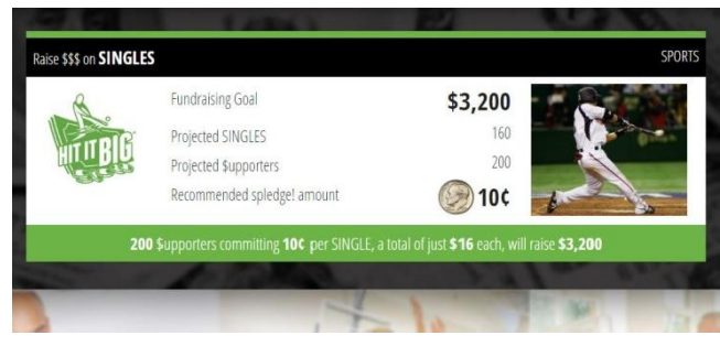
Online Fundraising Platform